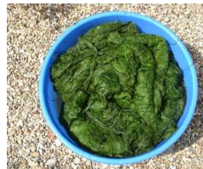
Bowl of blanketweed

Blanket weed is the bane of many koi keepers lives. If you have got it you will understand the frustration and constant work it causes, - if you haven't then you are very lucky. For the past few years I have always used chemical treatments to control the dreaded weed. Concerned about the constant use of chemicals, I was looking at alternatives.